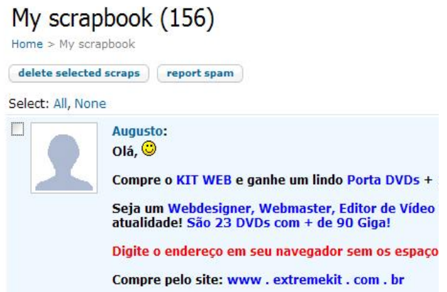
Figure 5. Example of spam 2.0 in an online community

Social bookmarking website where user can share videos and contribute to others submitted video, online communities where users can make a virtual identity and communicate with others, etc are few example of social networking platforms. Social networking platform provide different facilities for content sharing and communication Such as private and public messaging, comment system, interests, etc. However each of such facilities (Table 1) can be compromised by spammers to host spam like creating fake user profiles, sending private spam message, spam commenting on users profile, posting unsolicited videos, making promotional links etc. Hence such platform has more risk of being infiltrated by spam 2.0 and much harder to manage. Figure 5 shows an example of spam 2.0 in an online community. Spam 2.0 hosted on genuine user profile as a kind of comment.